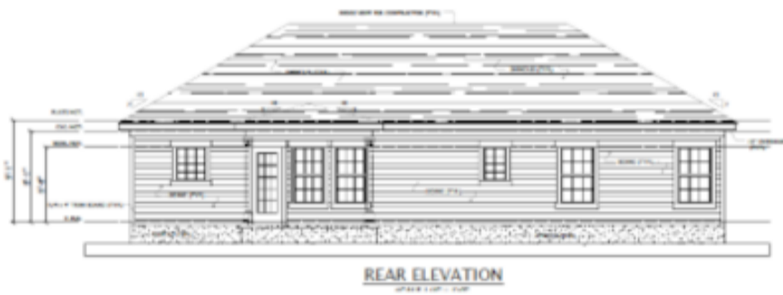
REAR ELEVATION SCALE 1/8" = 1'-0"